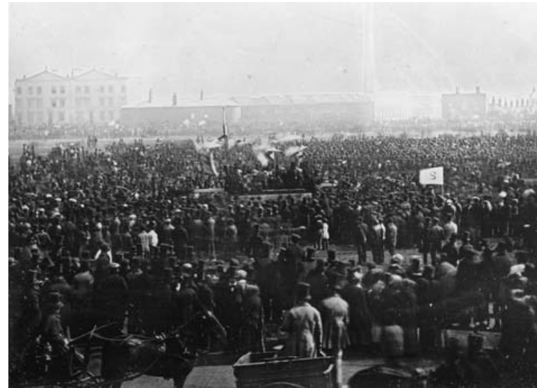
74 William Edward Kilburn, The Great Chartist Meeting on Kennington Common , 10 April 1848, daguerrotype. Windsor Castle, Berks.

In the age of film, it became possible for viewers to imagine that they were watching the rise of Hitler. Before the camera, woodcuts and engravings were already performing similar functions.