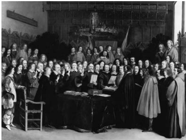
75 Gerard Ter Borch, The Swearing of the Oath of the Ratification of the Peace of Münster on 15 May 1648 , 1648, oil on copper. National Gallery, London.

Of another of Trumbull's history paintings it has been argued that