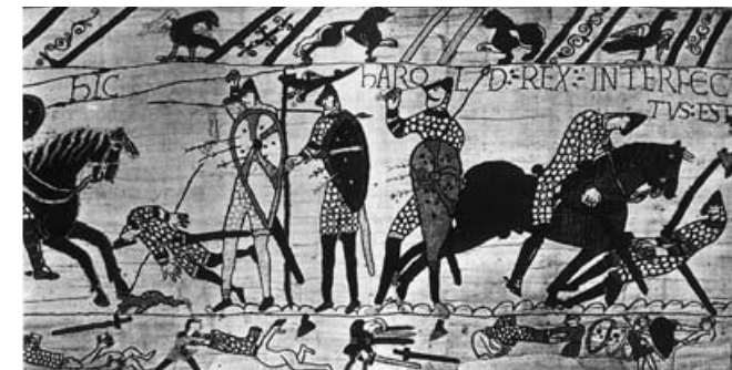
78 Detail of the death of King Harold during the Battle of Hastings, from the Bayeux Tapestry, c. 1100. Musée de la Tapisserie, Bayeux.

An exceptionally important strip-narrative, about 70 metres long, is the Bayeux Tapestry, and its testimony has often been used by historians concerned with the Norman Conquest of England and the events leading up to it. Modern accounts of the battle of Hastings, for example, generally describe the death of King Harold as the result of an arrow entering his eye. This detail derives in the first instance not from a literary source but from a scene in the Bayeux Tapestry (illus.