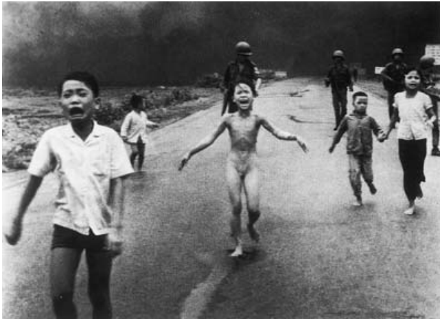
77 Hung Cong Ut, Napalm Attack , 1972, photograph.

The heroic style survived the Second World War in certain locales, in paintings commissioned by British officers' messes, for example, or by the government of the USSR. By this time, however, the majority of twentieth-century artists and photographers of war were expressing the values of civilian, democratic or populist cultures in their choice of alternative styles. Battles were increasingly viewed from below. John Sargent's Gassed (1919), like Robert Capa's famous photograph of a Spanish Republican infantryman (Chapter 1; illus. 4), represents the tragedy of the ordinary soldier, while Hung Cong Ut's equally celebrated photograph, Napalm